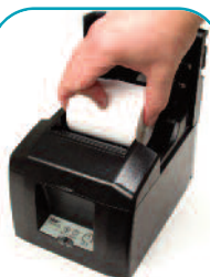
Easy Drop-In & Print